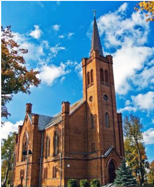
The Birzai Church

Meet with representatives of the Evangelical Reformed Church of Lithuania and continue to develop the 'Relational Partnership' between that denomination and the Presbytery of Carlisle.