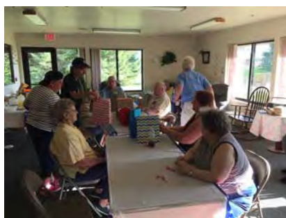
Gathering at Brindle Estates & Terrace Senoir Living

The Presbyterian Church of the Upper West Conococheague in Mercersburg, PA maintains an active mission outreach to the local community. In the Fall, Deacons provide and fill Backpacks with required school supplies for (30) Elementary School children for the School Nurses to distribute. In December, the Deacons partner with local Ministerium