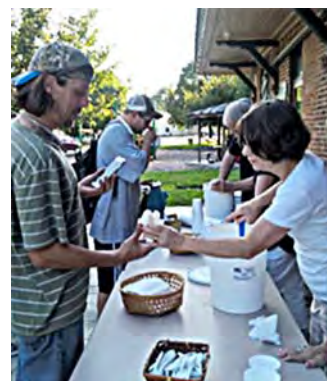
Enjoying a Picnic with Friends

Second Church is located in the wonderfully diverse town of Carlisle. Daughters of the American Revolution and African-Americans call Carlisle home. So do Bosnian immigrants, Muslims and Jews, dancers and law students, Army officers and pacifist Mennonites, farmers, government workers and warehouse drivers. We are really a community- of-communities. Some communities are based on where we live, work, or worship. Some are based around great institutions like the Army War College, Dickinson College, or the Central Pennsylvania Youth Ballet. Some are based on race, religion, language and class. For all kinds of reasons we often stick to our own communities – eating, learning, working, and growing up together (but missing out on connections with others). Too often -- once we venture outside whatever we think of as our own neighborhoods -- we are strangers to one another.