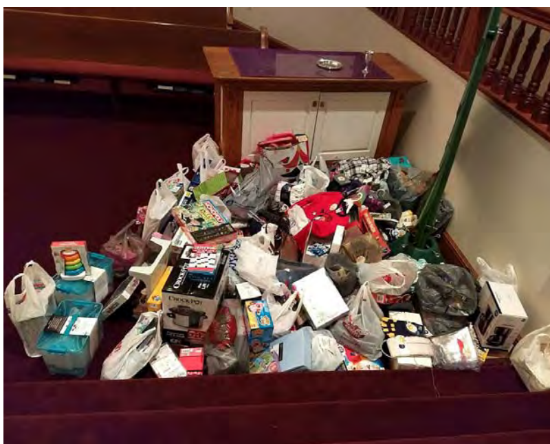
Collections for the baskets for New Hope Ministries

Each year in late November, members of the congregation are asked to bring in specific donations to go into these baskets. These include items such as fresh fruit, energy bars, and certain canned products. Then usually either the first or second Sunday in December, during the Sunday School hour,