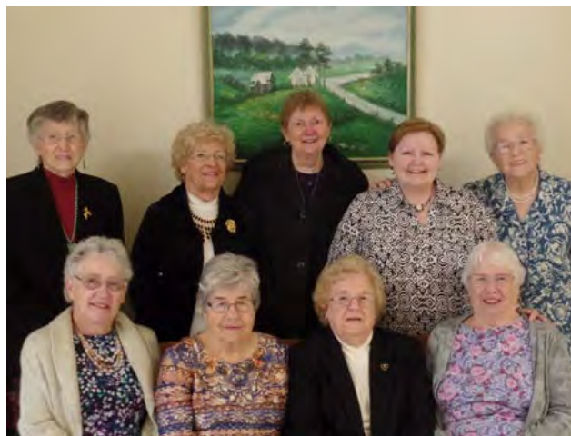
Great Conewago Presbyterian's Women's Association

Please pray for: The Women's Association of Great Conewago Presbyterian Church Ministry