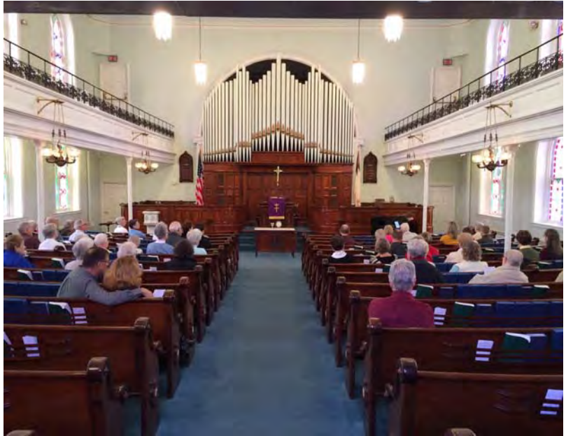
Enjoying a Lenten Luncheon Concert at First Church

For 10 years First Presbyterian Church has sponsored a Lenten Luncheon Concerts. At noon a local person or group shares their talents with the audience with a variety music both singers and instrumentalists have played. Following the 30 minute concert the community fabulous cooks share the talent with homemade soups and desserts. An offering is taken at each event and ALL proceeds go to the Project SHARE food bank in Carlisle.