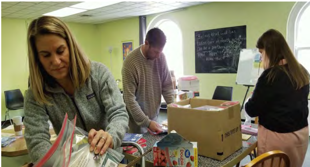
Fall Mission Day Work

Every fall, First Presbyterian has an all church Mission Day. There are a variety of projects, such as buckets and schoolbags for victims of natural disasters are filled. Yard and house work for shut-ins and ailing members of the congregation are offered. Personal care items for local homeless shelters are collected and distributed. Packets for the year-round mission of giving a book and knit hat to each baby born in Carlisle Hospital are assembled.