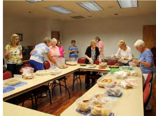
Members work on a project during More People Caring Sunday

A variety of health items were gathered, an assembly line was created, and kits were assembled and delivered to Health Ministries in Harrisburg.